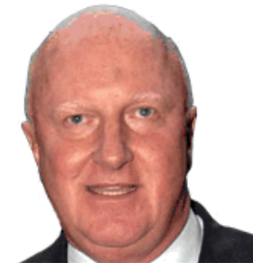
L. Dennis Kozlowski