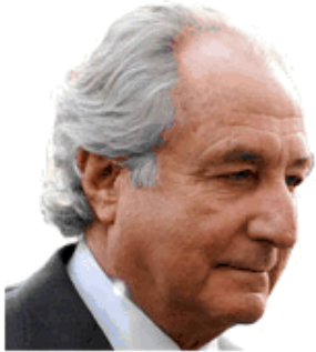
Bernard L. Madoff