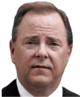
Jeffrey K. Skilling