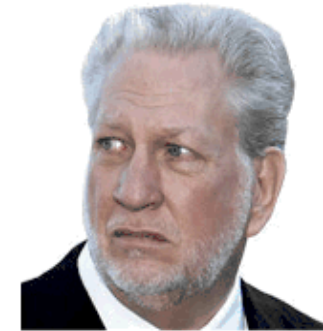
Bernard J. Ebbers

Disclosures pointing to stress and questionable dealings, accusations