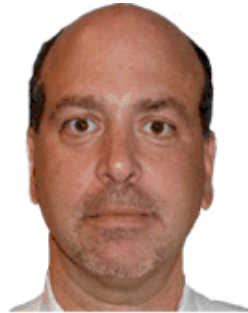
Samuel Israel III