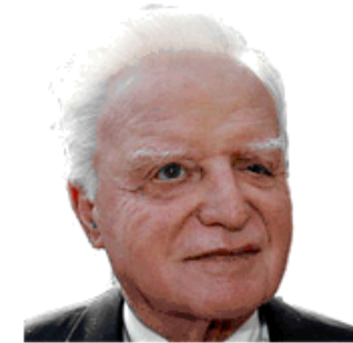
John J. Rigas